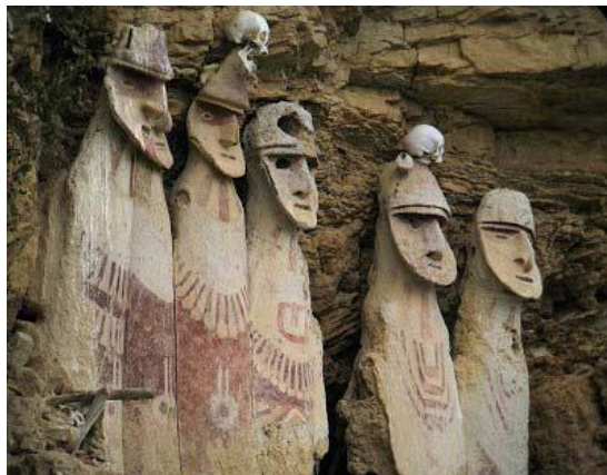
Cloud people of the Chachapoyas culture

The Ether Ship is now planning on traveling to Peru in June 2015 to visit the Northern areas where such temples as Chavin de Huantar and the ancient urban center of Caylan on the North Central Coast of Peru can be found. Recent discoveries of the Cloud People from the Chachapoyas culture in the Amazon basin indicates a unique culture once existed high on the ridges of the Andean mountain range.