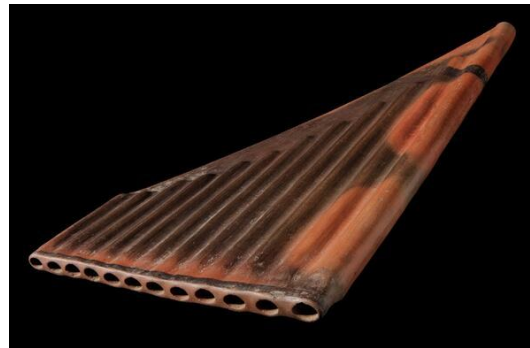
Ancient Peruvian ceramic pan flute

In Caylan fragments of ceramic pan flutes have been found.