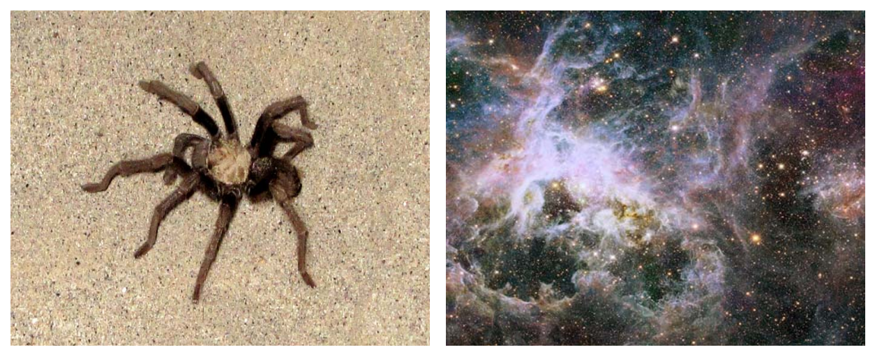
Tarantula at Anza Borrego

What happens when I make the sounds? Who or what directs the choices of phasing the sounds? It is at this junction I want to explore this second form of sound creation which emerges when the deeper substrates of our whole sensorium is penetrated by sounds not only being created by human intervention but also sounds that are coming from space and the sounds reverberating off the canyon walls accompanied by sounds of the birds which were also in the same environment. What I am saying is that when the sounds reach our ear and our inner cognitive domain nested under our daily cognitive reality newer thoughts filter up and into our thoughts forcing a new orchestration to be implemented independent of the seemingly intentional choices that has the appearance of making the sounds. This secondary presence of a force creating sound is created by many external stimuli as I have already mentioned. One of those external stimuli came about as a result of the presence of a tarantula.