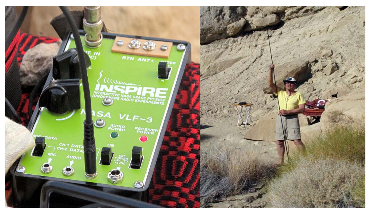
VLF Receiver and installation of antenna