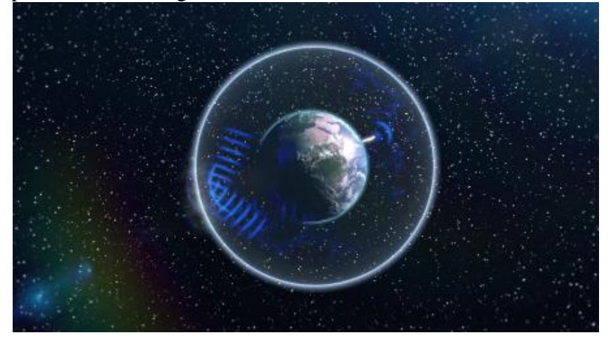
biophotonic charge into space which is coming directly out of our DNA.