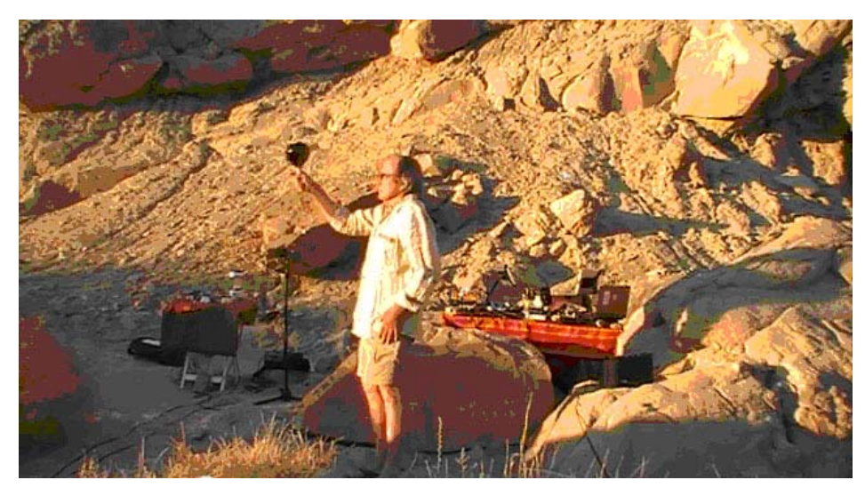
Youtube showing the shaking of the sacred Cahuilla rattle

The last sounds made before the sonic orchestrations were made in the desert was to play a pre-recorded Bird Song into the canyon to announce the presence of the spirits of the Cahuilla people and shake the sacred rattle along with the chanting. These were the three unique sounds that preceded all other sounds made in the desert.