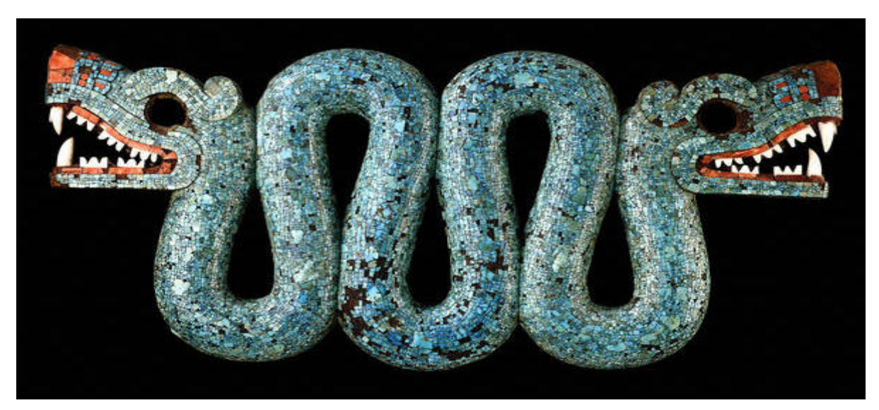
Blue turquoise dragon

For these reasons The Ether Ship will make a pilgrimage to Chaco Canyon and perform a ritual performance in honor not only of the ancient people from that area, but to their interpretation of the ancient skies having celestial life forms associated with it.