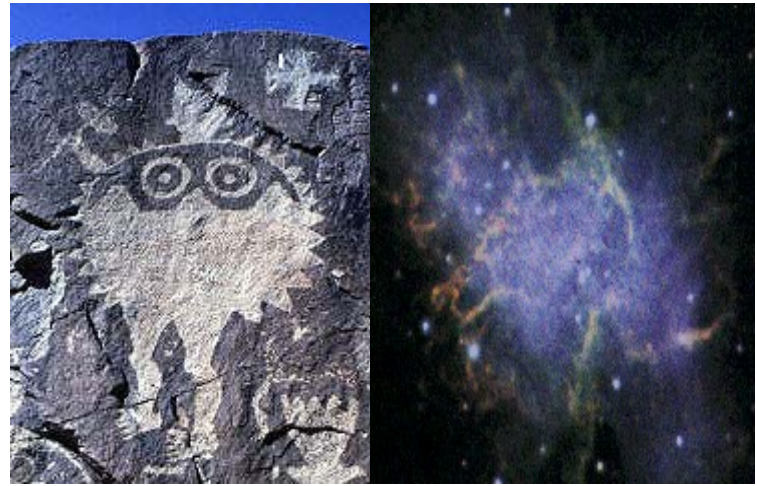
Chaco Canyon petroglyph and Crab Nebula Super Nova 1054AD