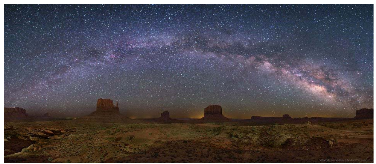
Milky Way galaxy above Chaco Canyon

determine exactly what cosmology was developed but one that incorporated the heavens is certainly a safe guess.