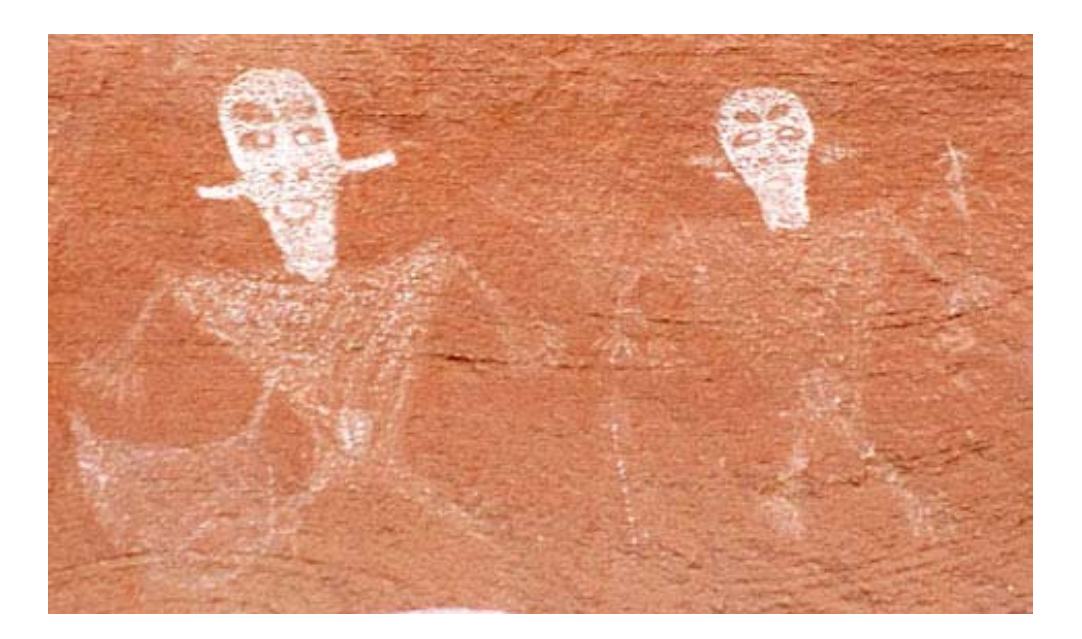
Chaco Canyon petroglyph star people

Probably the most dramatic celestial event to be witnessed by the ancestral Puebloans was the supernova of 1054AD. It shines as a nebula of magnitude 8.4 near the southern "horn" of Taurus, the Bull. The impact of seeing this bright object in the sky resulted in many petroglyphs which appear to have the form of beings that look like aliens from another world. But for these ancient people, interpreting this bright object in the sky gave cause for incorporating celestial events into rituals and ceremonies.